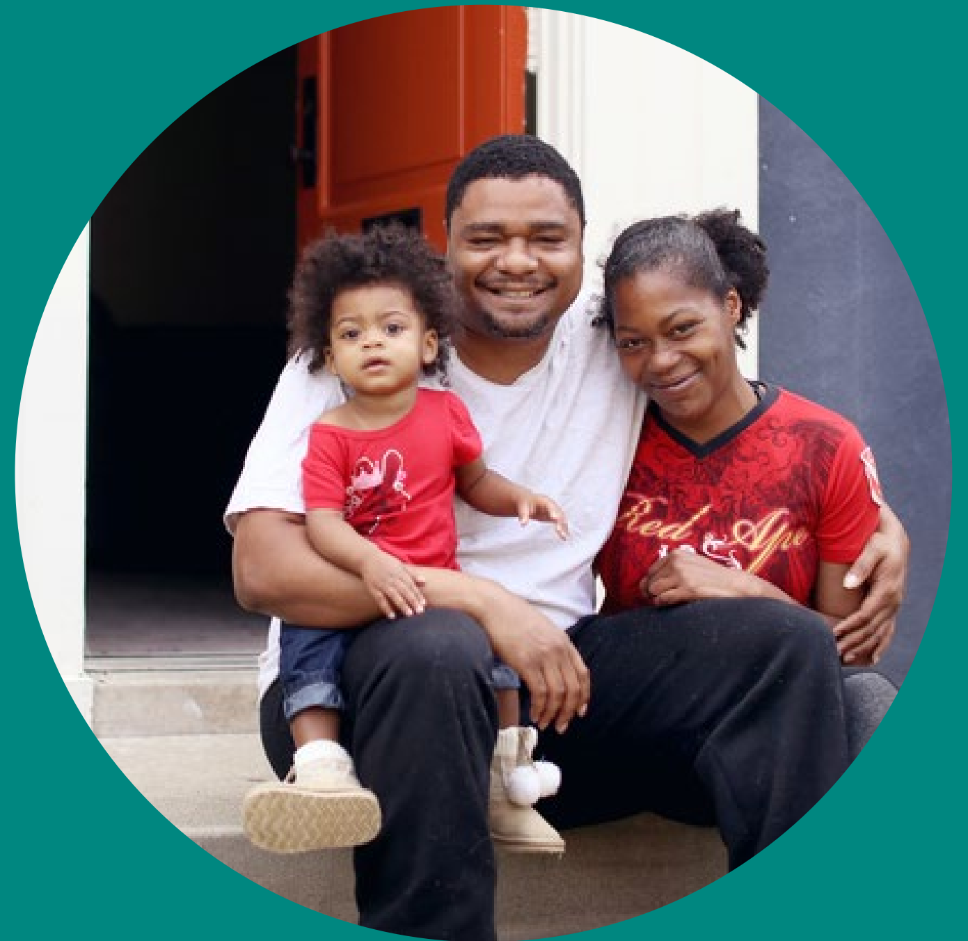
The Shockley Family at their new home.